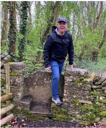
Bibury Public Foot Path, England

I missed you! We know the sabbatical time set aside for pastors is a designated “time away” from regular work responsibilities. It includes an intentional time for rest, reading, prayer, play, rejuvenating study and spiritual discernment. Returning from a three-month sabbatical will most certainly require the same intentionality in order to acclimate and assimilate. I liken it to adjusting to a new altitude when traveling to, say, mile-high Boulder, CO. Thoughtful and measured movements so one can catch a breath. The alternative is returning like reentry of Boeing's Starliner Space Capsule without being ready for ‘all systems GO!’