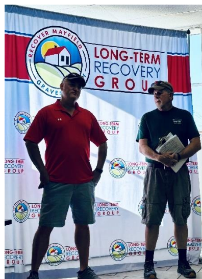
Work site Leaders