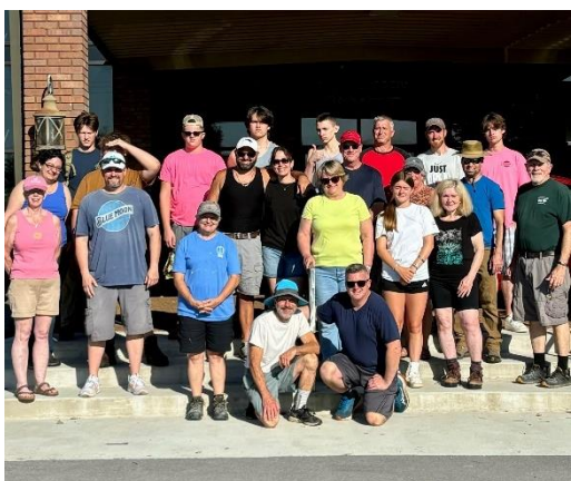
Before heading out...