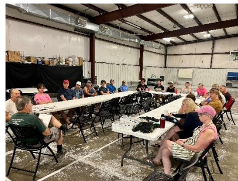
Kentucky Mission Trip Work Orders Meeting