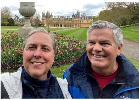
The Waddesdon Estate, England