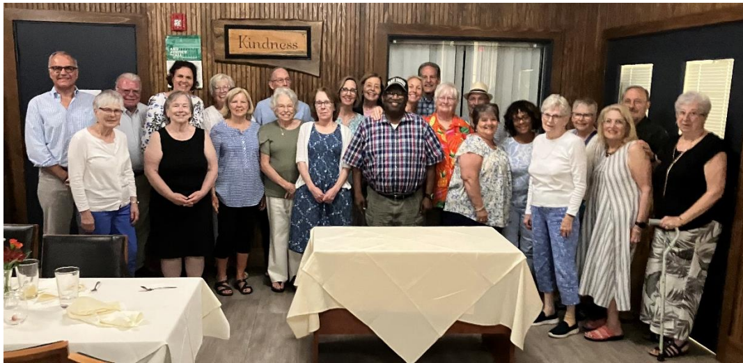
Photo of the parishioners who attended the dinner at Gather 55 on June 27 th

Milkweed & Monarch Butterflies - We have quite a few milkweed plants popping up around the east side of the sanctuary. It's tempting to want to remove them but this time of year is when Monarch butterflies are laying tiny eggs. The hatching caterpillars will feed on the leaves of the milkweed and eventually make their cocoon or chrysalis to transform into a butterfly. Did you know that the milky sap is toxic to all creatures except the Monarchs?